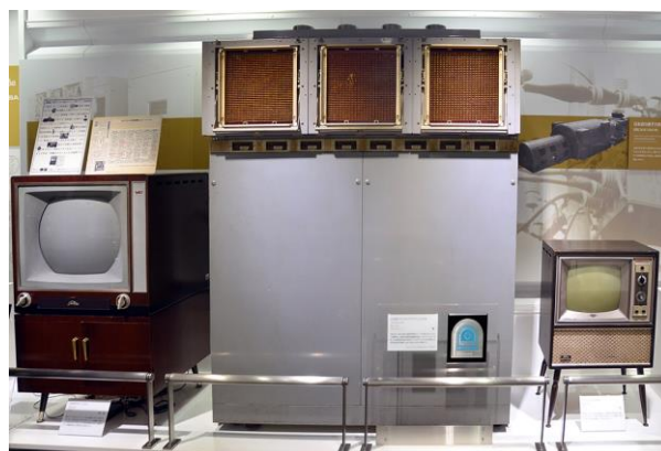
KT-Pilot and NMNS Plaque (blue one)