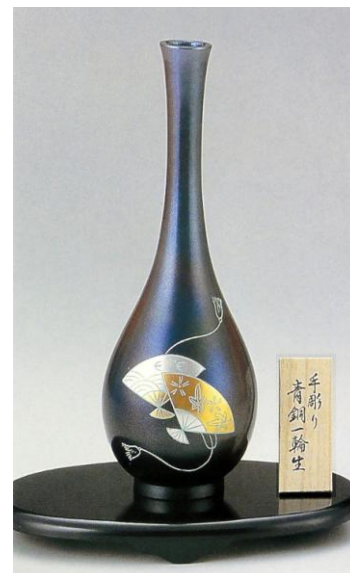
The IPSJ presents the CS with a memorial for the 25 th anniversary of the affiliation between the CS and the IPSJ.