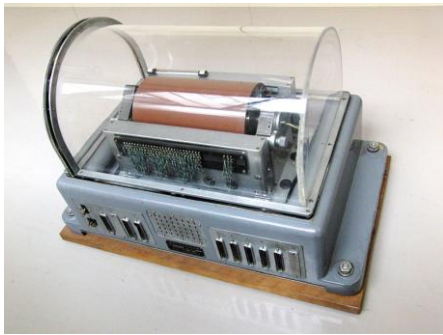
KT-1's magnetic drum