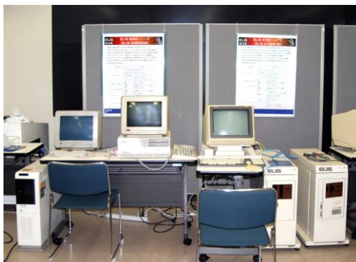
JAIST collection: ELIS workstations

The IPSJ also certified the Japan Advanced Institute of Science and Technology (JAIST) Collection of Symbolic Processing Computers in Ishikawa as a Satellite Museum of the Historical Computers. The museum preserves more than 10 symbolic processing machines such as ELIS developed by NTT in 1980s, some of which are operational.