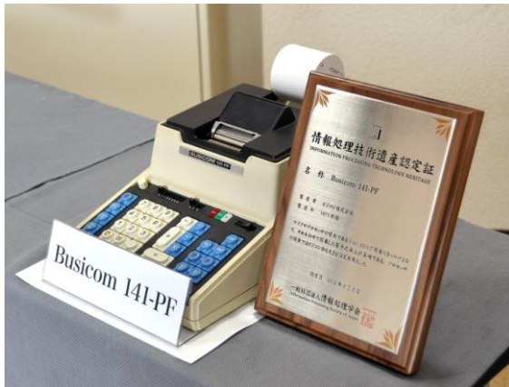
Figure 1 Busicom 141 PF and its certificate